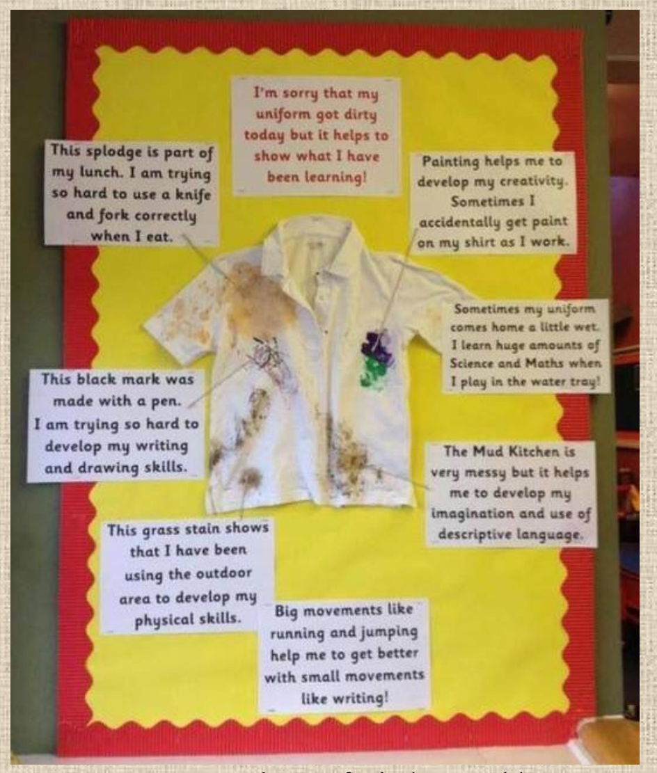
...Growing together in faith, love and learning