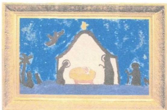
INFANT 3RD PLACE 2022/23