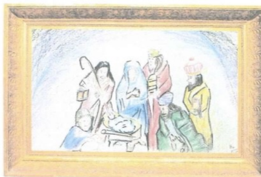
JUNIOR 3RD PLACE 2022/23