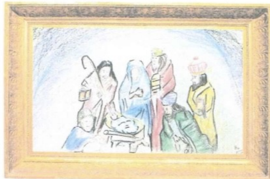
JUNIOR 3RD PLACE 2022/23