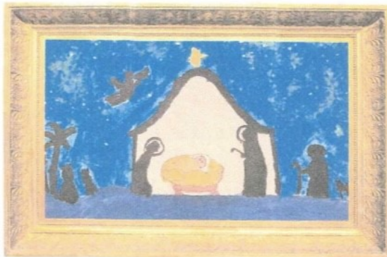
INFANT 3RD PLACE 2022/23