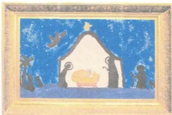
INFANT 3RD PLACE 2022/23