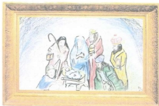
JUNIOR 3RD PLACE 2022/23